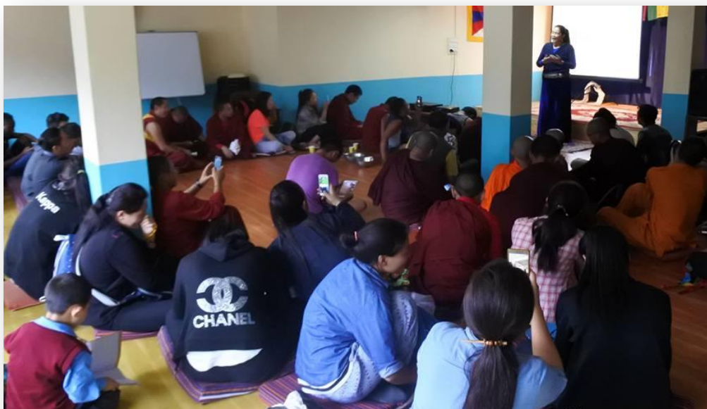
Songs by students on Trunkar