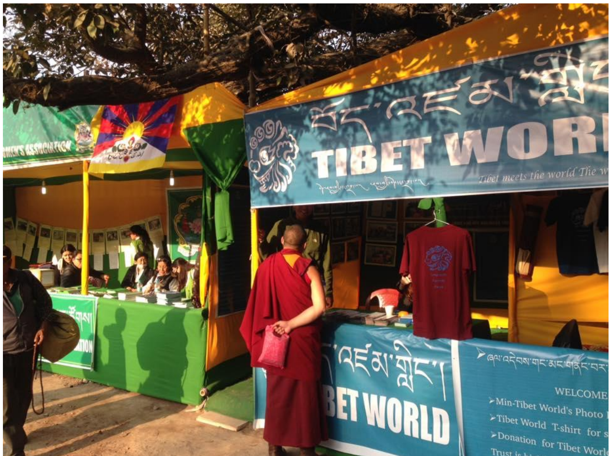
Tibet World Buddha Gaya

After the academic year ends in December, Tibet World usually has a one-month winter program for school children. In 2016, this program did not run due to the scheduled teaching from H. H. the Dalai Lama at the 34 th Kalachakra. During this event, Tibet World ran the Bodh Gaya Project from the 21 st December to 20 th January, for 29 days. The main purpose of this project was to promote and raise funds for Tibet World. We had a small photo exhibition, brochures for distribution, and Tibet World t-shirts for sale.