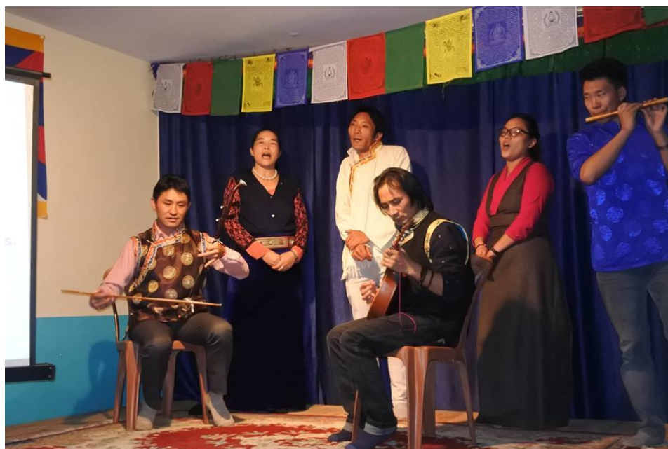
Music presentation at folk cultural show

In 2016, Tibet World hosted 30 folk shows. We provided platforms to more than 35 students, volunteers, and local Tibetans who are interested in performing. We offered a complementary allowance for their contribution to all the folk artists. We had a total of 618 people in the audience over the course of this year, from March to October.