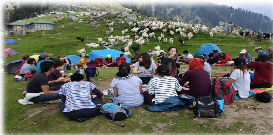
Joy in sharing the lunch on top of mountain of Truind

In 2016, Tibet World organized a hiking program for the entire family to climb up Truind to learn more about the region and put language skills into action. Reaching the final point was not a tough task for the group as they were many beautiful scenes to view. There were stalls along the way that provided tea and snacks whenever participants wanted. At the peak, we played various organized games with the students, staff, and volunteers. Then around 4pm the group started to climb down with lots of contentment and satisfaction.