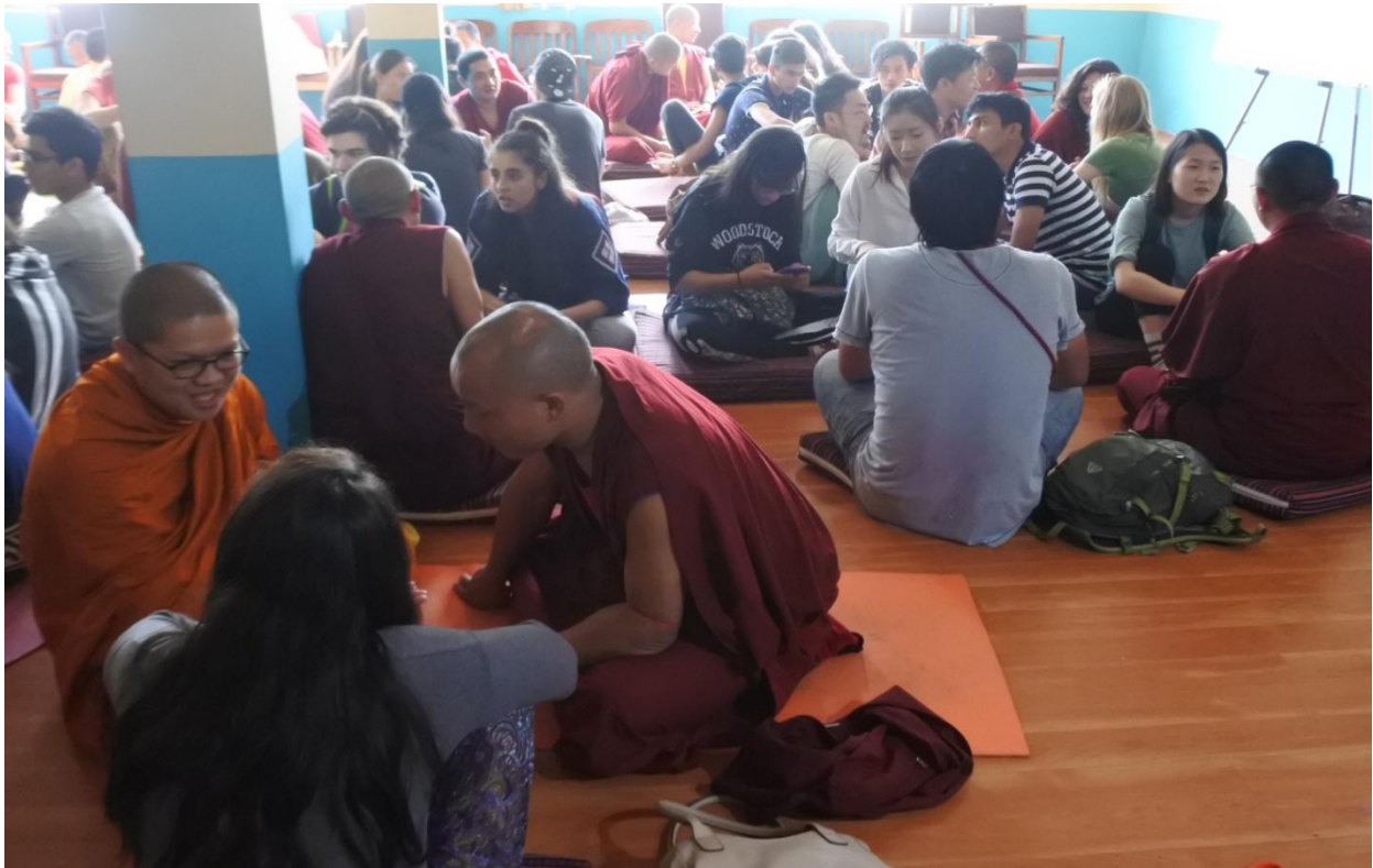
Students learning together

Students must complete a placement test before starting any language course at Tibet World. This allows our staff to place them in the appropriate course level. Each language has three levels: elementary, beginner, and intermediate. The courses run on a 3 months cycle and students must pass a proficiency exam before proceeding to the next level. Successful students with >70% attendance rate receive a proficiency certification based on the level they have completed.